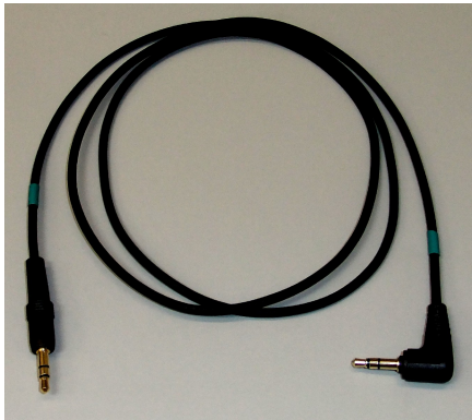
Transmit Audio Cable

The KX3-PCKT cable set interfaces between the Elecraft KX3 and personal computers, and provides convenient connection to an external foot switch and RF power amplifier. This cable set consists of four components: a 3.5mm stereo right-angle to straight through cable (green band), a 3.5mm stereo right-angle to straight through cable (red band), a 2.5mm right-angle to 3.5mm cable, and a 2.5mm stereo right-angle to KEY OUT and PTT IN (or Transmit Inhibit, or AuxBus) molded module. These components are shown in Figure 1.