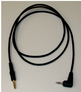
I/Q Output Cable