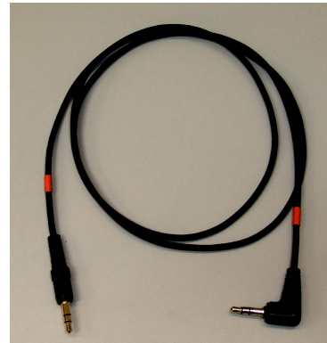
Receive Audio Cable