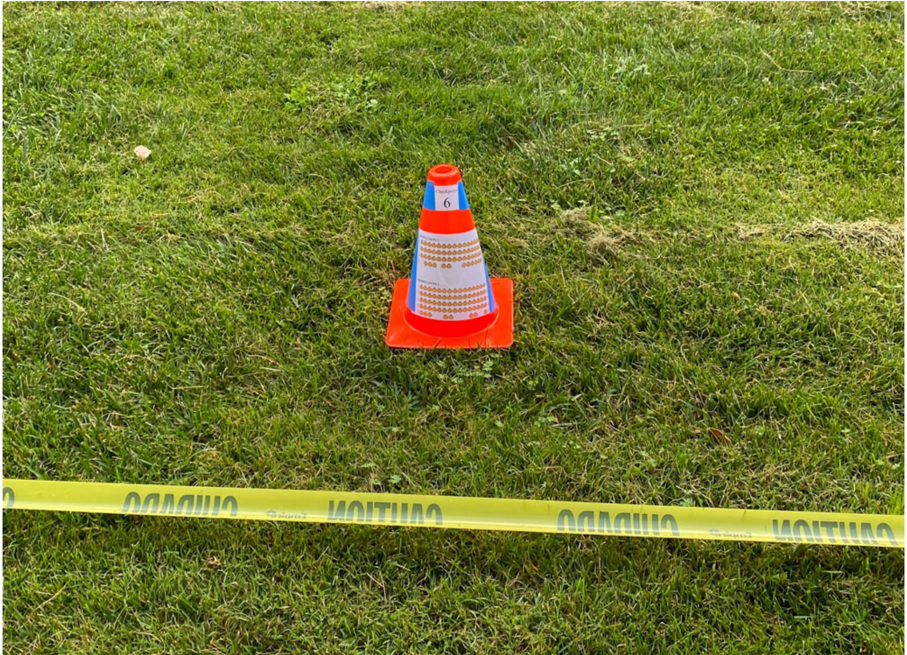
The crowd count is found on the checkpoint cone.