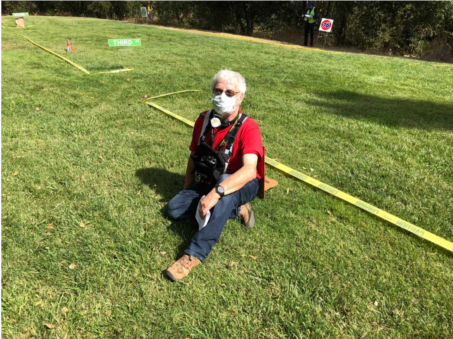
Driver sitting in sports car illegally parked on route