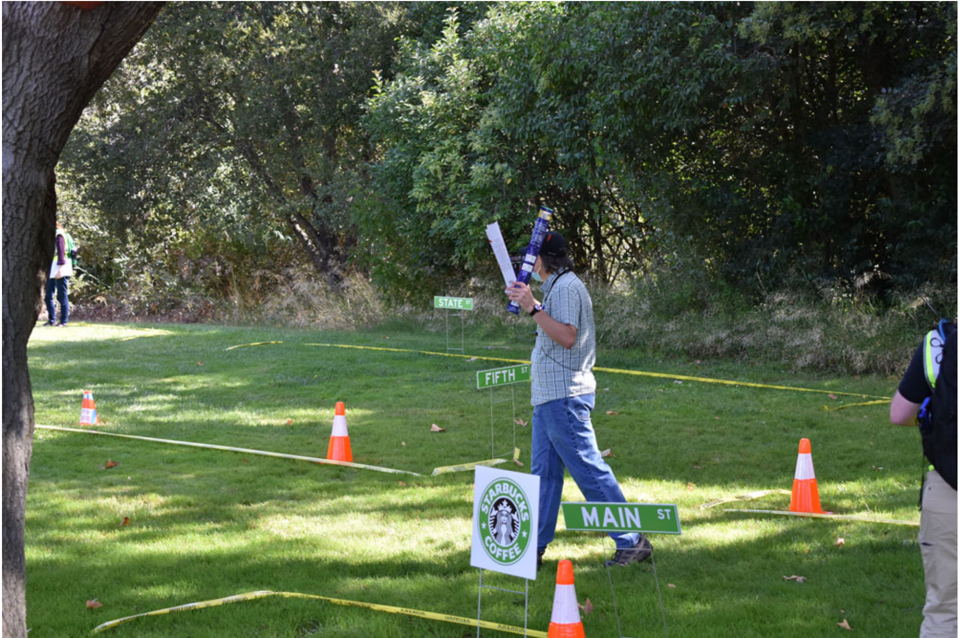
Illegal vendor tries to sell glow-sticks after parade ends.