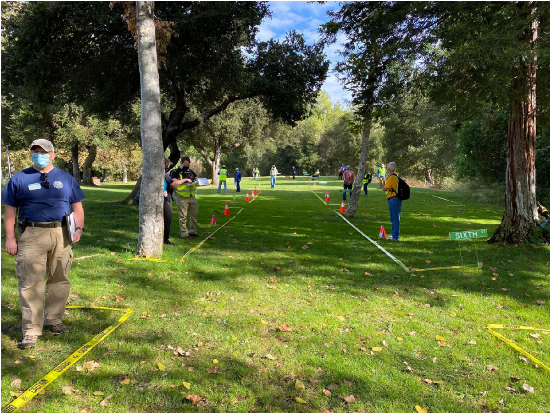
Checkpoints in position