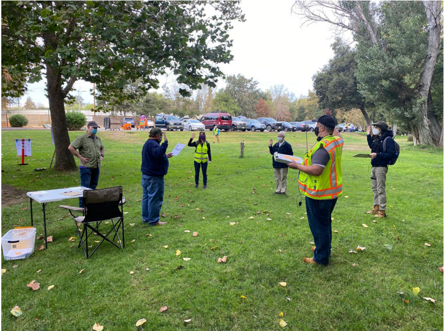
Hams are sworn in for DSW.