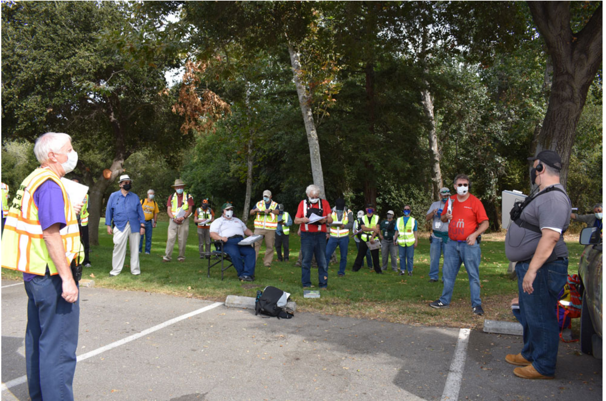
Everyone gathers for the Debrief