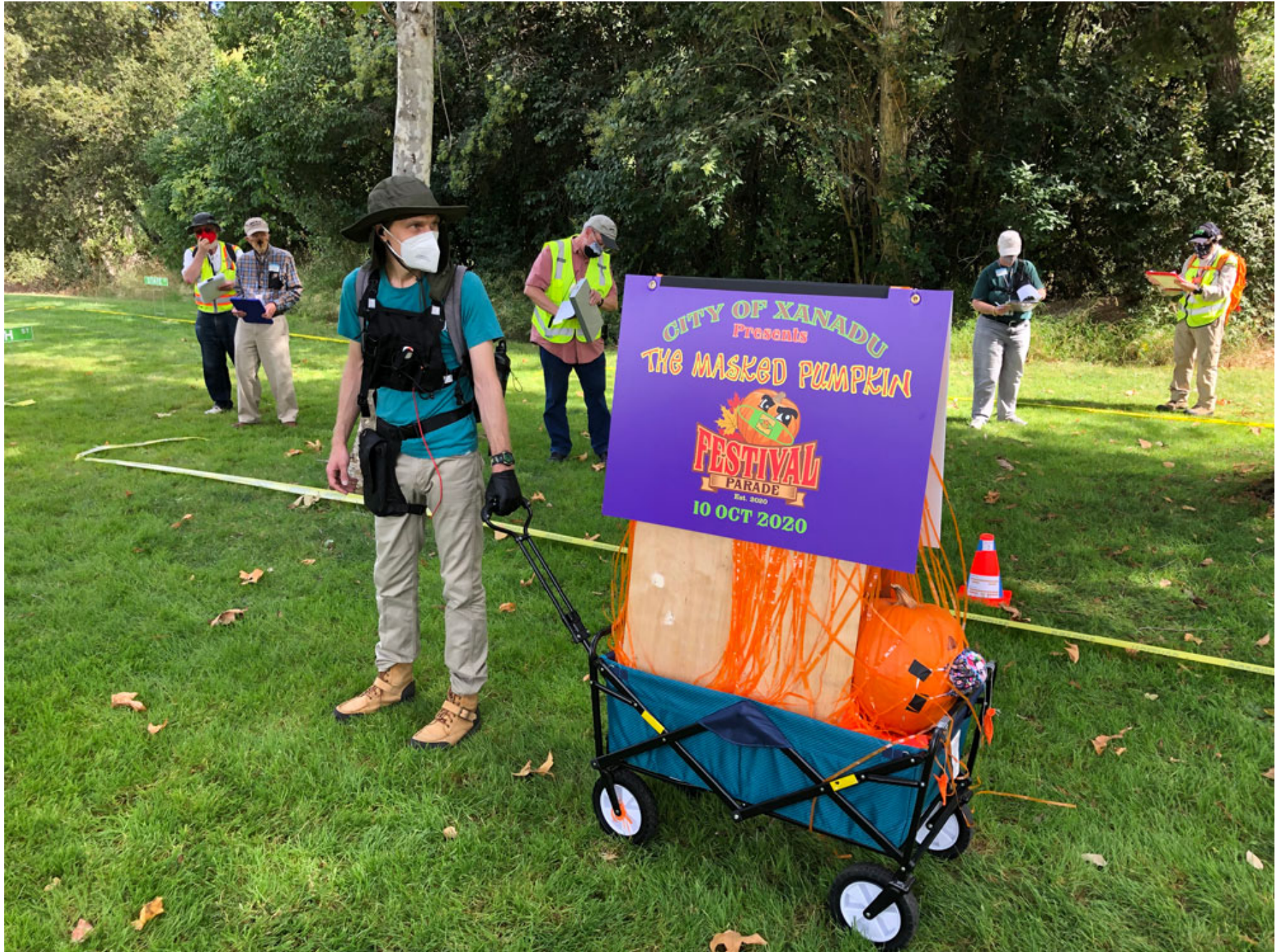
First Float passes a checkpoint.