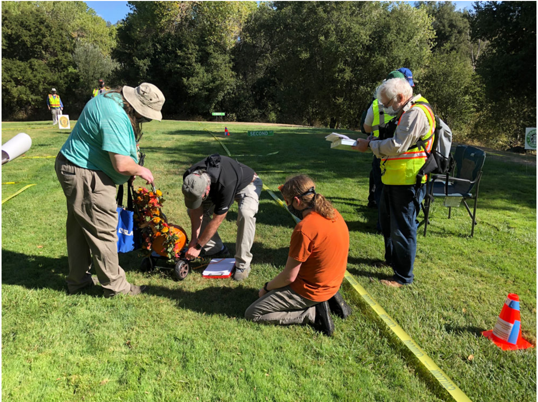
Yay! Parade “fix-it” expert arrives and repairs the float.