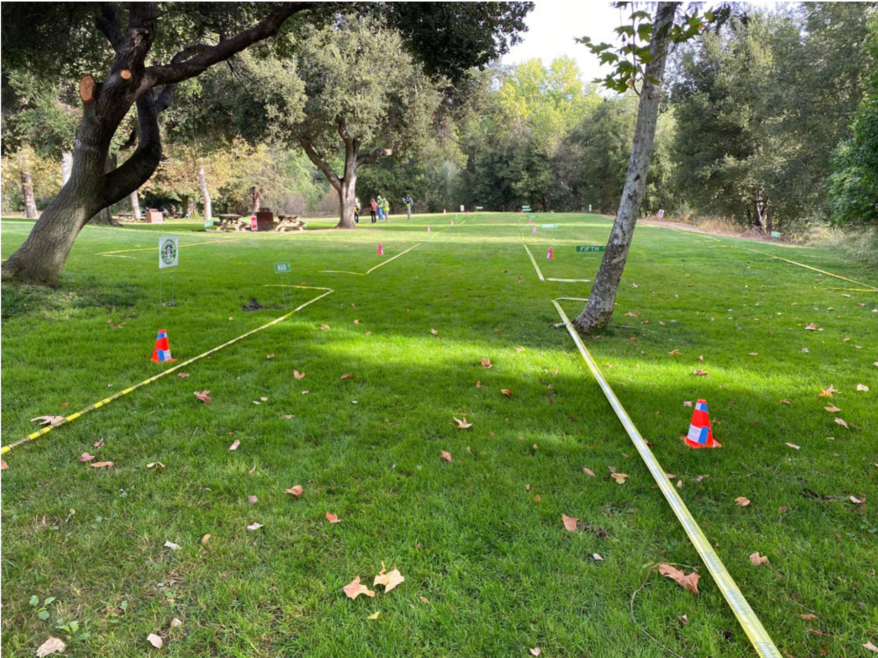
View down Main Street before parade starts