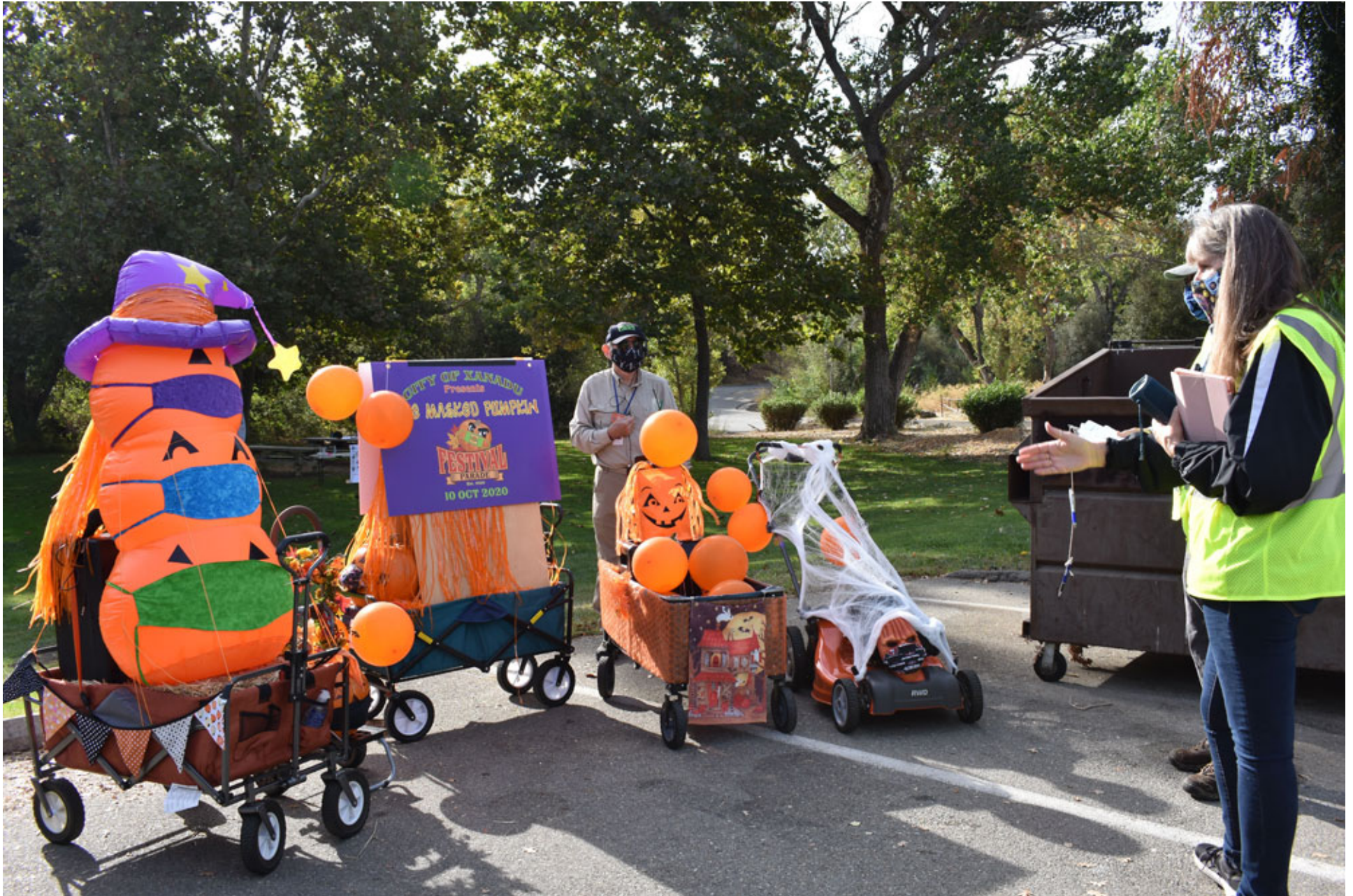
Floats assemble for group photo.