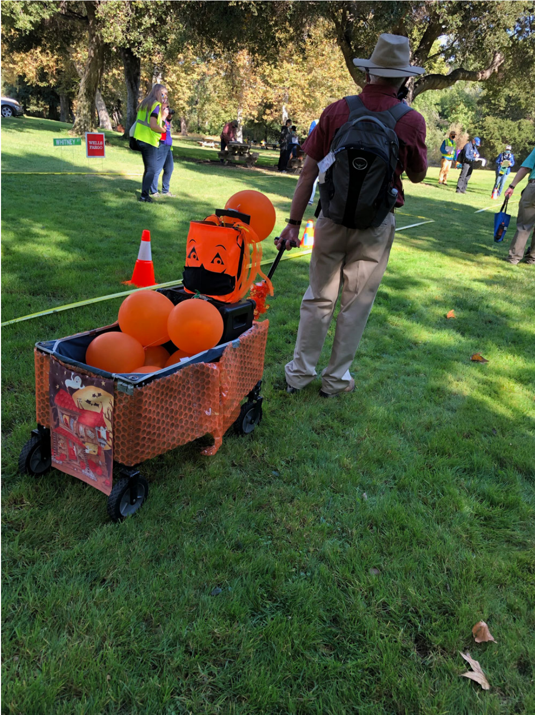
Princess float passes by.