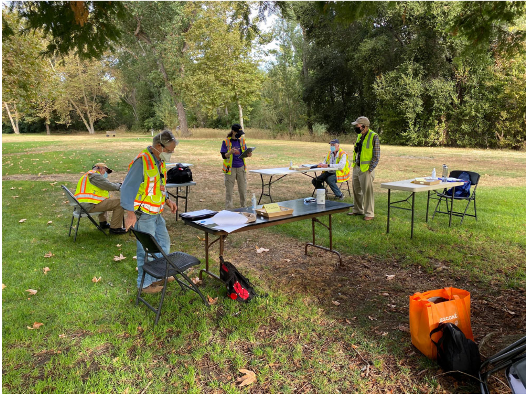
Net Control briefing and set-up