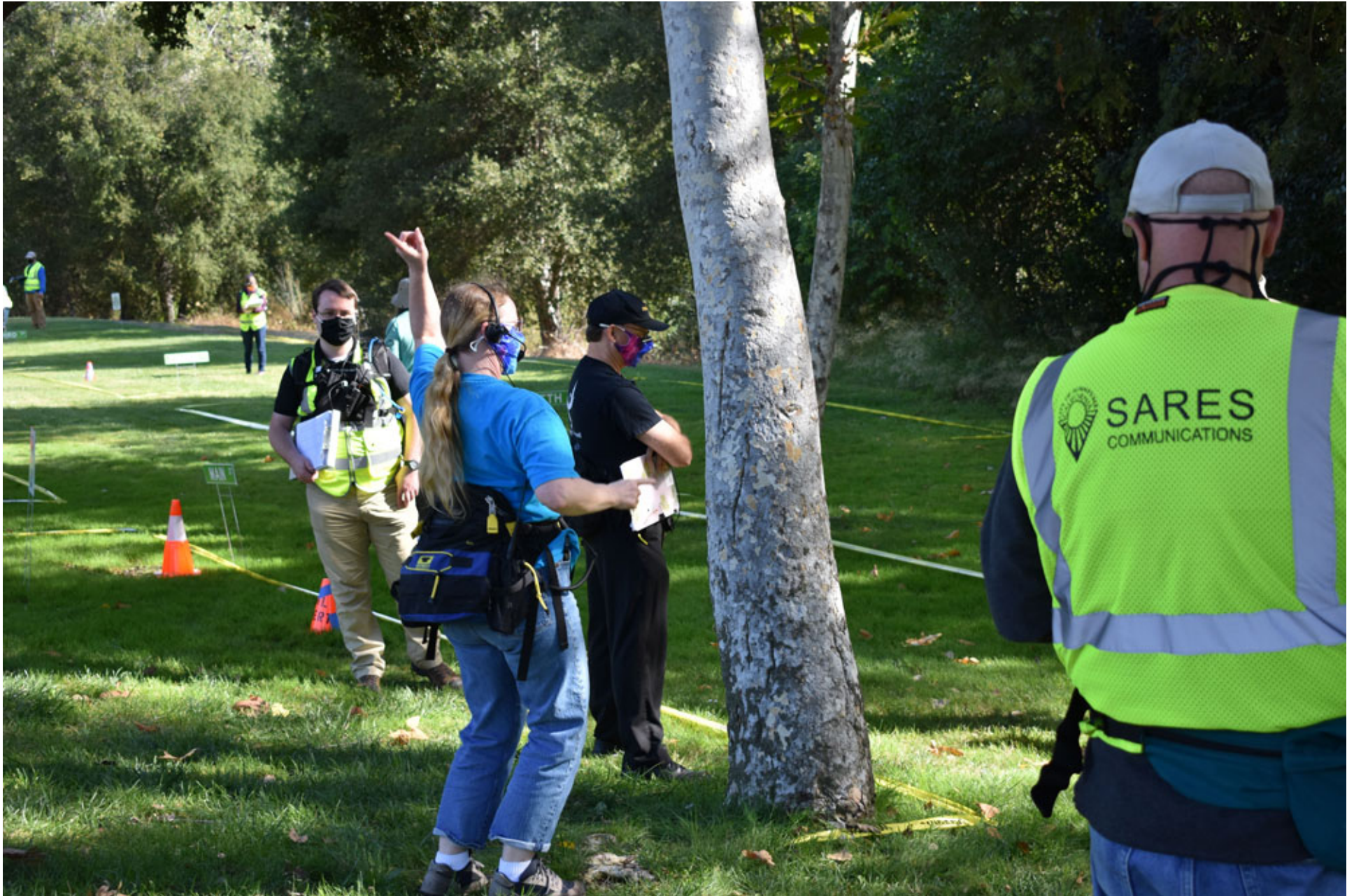
Checkpoint 1 watches crowd person dancing to the music of First Float.