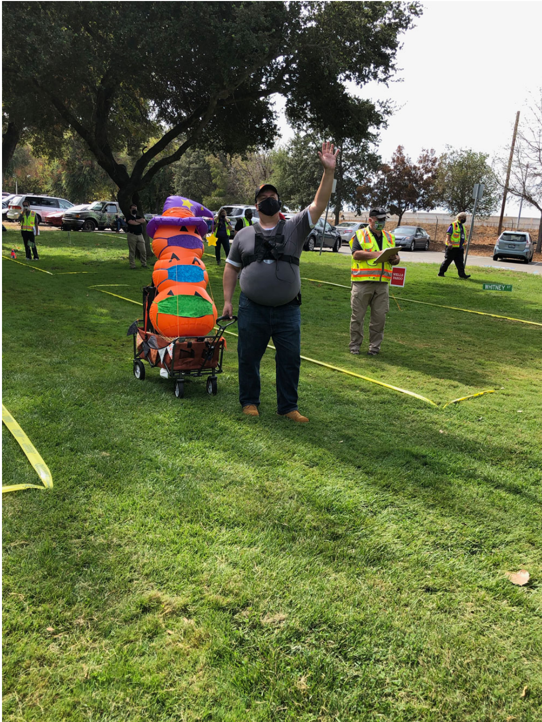
The last float enters the parade.