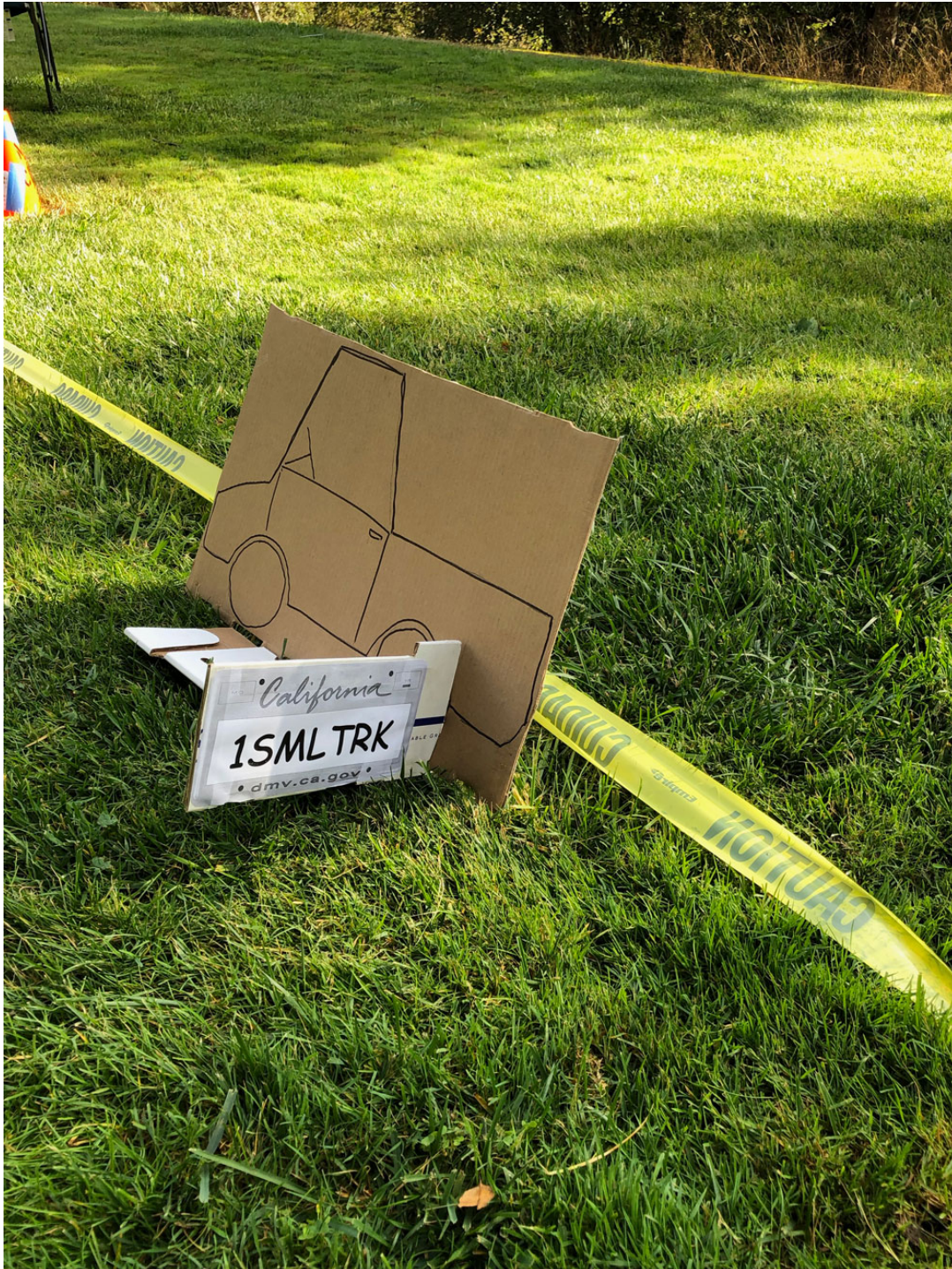
Truck illegally parked on parade route