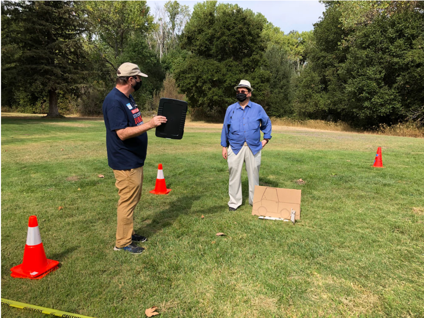
Parade Official explains that the truck can't cross barrier yet even though parade ended.