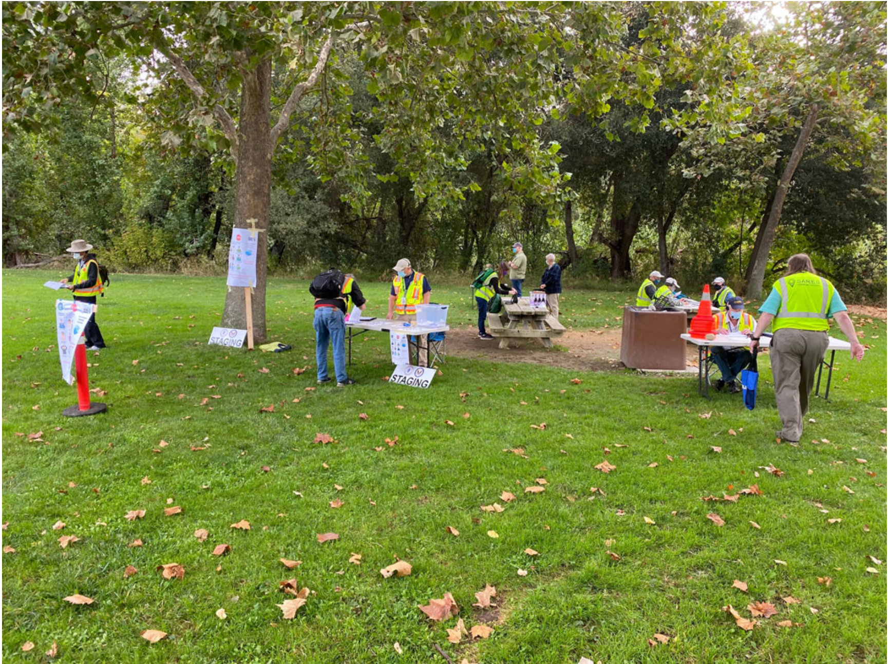
Staging takes check-ins.