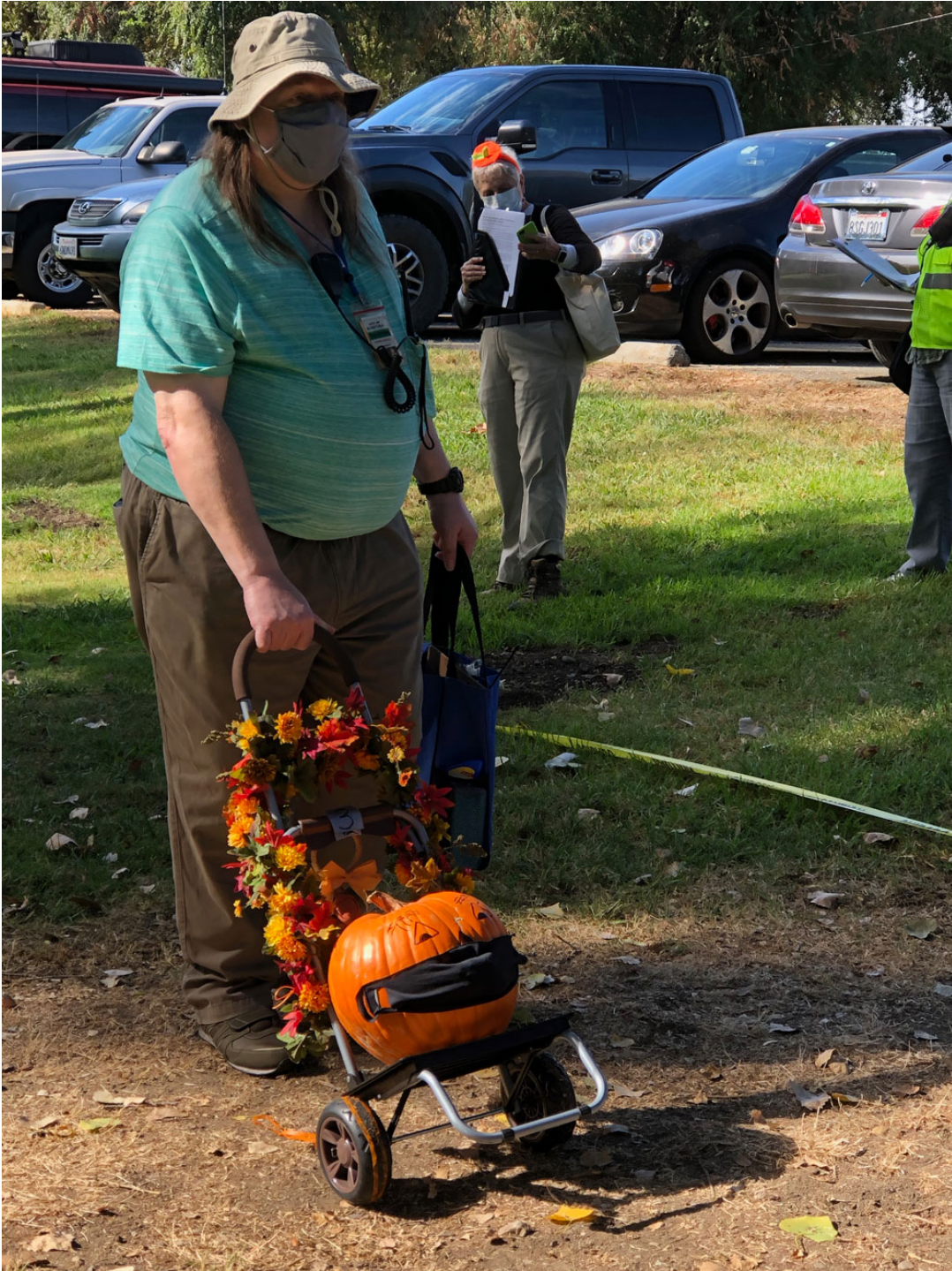
A flowery float comes along.