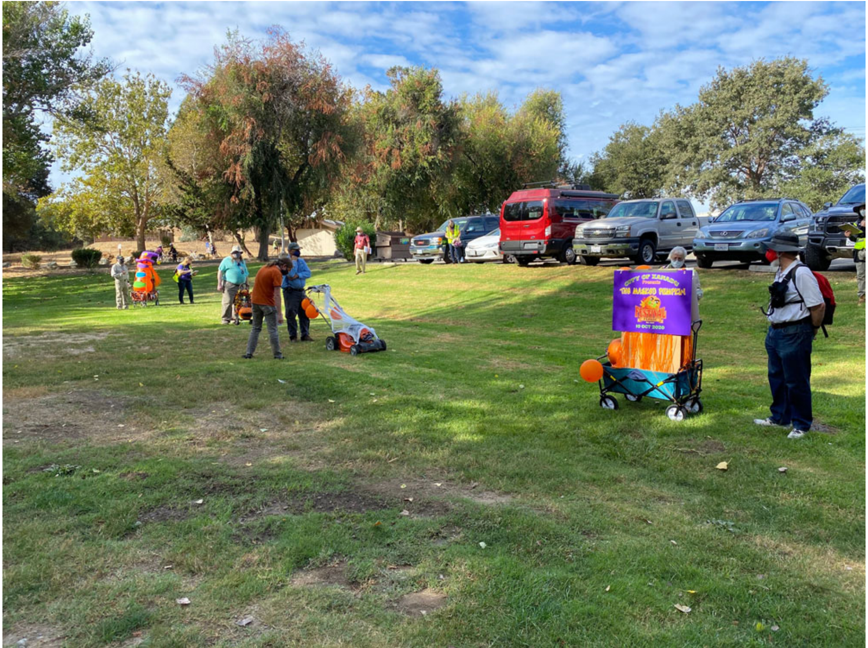
Floats line up at Plaza South.